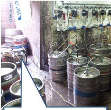
Generator stored underneath hatch (not open at the time of the incident)