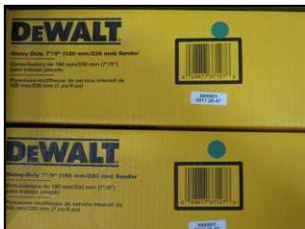
Green dot stickers indicating improved design

Large Angle Grinders currently shipping from DEWALT have an improved design handle and are not affected. Grinders with a green dot sticker near the UPC and on the outside of the master carton as photographed below already have the improved design. New handles with the improved design will have a marking on the outer flange of the handle with an embossed "BL" as photographed below.